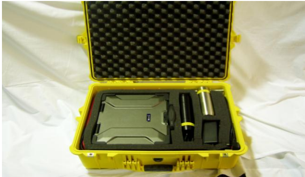
FMD system in transport case