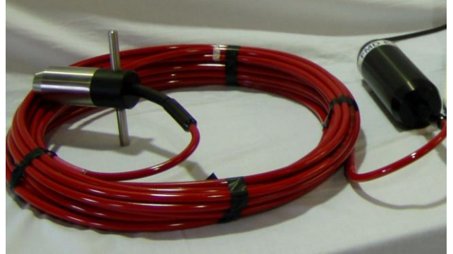
FMD Probe Applicator

This system is available for use with either Diver or ROV operation.